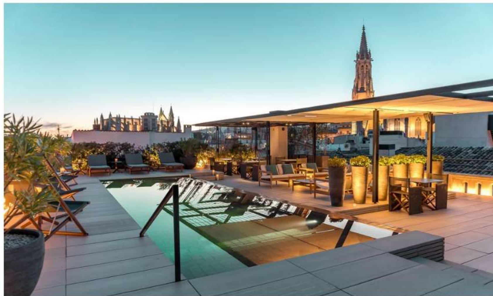
The Pool Terrace