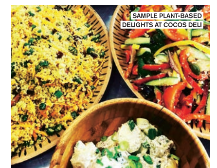
SAMPLE PLANT-BASED DELIGHTS AT COCOS DELI

"People don't associate Palma with art, but we have lots of stunning gallery spaces in the Old Town. Start with a coffee at Rialto Living, a design shop that holds treasures for everyone. Then, just up the street on Carrer de Sant Feliu, in an ornate 12th-century building is one of my favourite art galleries, Kewenig. Rooftop drinks are popular in Palma – most evenings you'll find me in Hotel Saint Francesc. You don't need to be a guest to enjoy their roof terrace as you watch the sun set, illuminating the city's beautiful sandstone buildings."