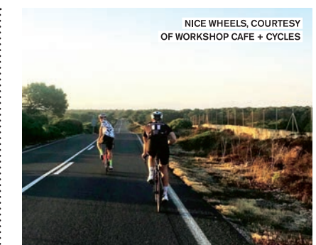
NICE WHEELS, COURTESY OF WORKSHOP CAFE + CYCLES

"Palma has changed so much in the eight years since I discovered this stylish city. Walk the streets of Calatrava in the evening when the shutters of the houses open up to let in the evening breeze – you'll see glimpses of lovely plant-filled courtyards. Palma is a classical music-lover's dream, as it has an amazing orchestra that holds concerts in exquisite locations, from the majestic and grand La Seu Cathedral to the historic Bellver Castle. I never enjoyed classical music until I came to Palma. Now I love it."