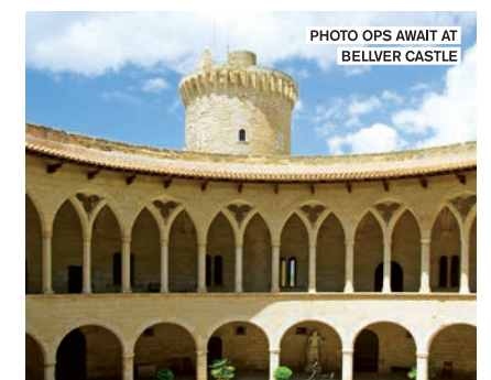
PHOTO OPS AWAIT AT BELLVER CASTLE

Book your Palma getaway at ba.com/gatwick