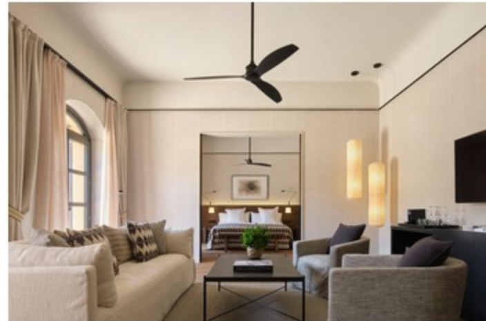
In harmony with the architecture of the city, the rooms are decorated in simple beige and cream tones. Natural fabrics and natural stone floors complement the setting. Can Ferrereta

Even from a distance you can see the stately Norfolk pine, which overlooks the city walls of Santanyà and marks the indoor terrace of the Can Ferrereta . The manor house in Carrer de can Ferrereta was in the hands of the Bonets, a prestigious family from Santanyà, then it was for sale in 2018. For the Soldevila Ferrer family, the opportunity to do what they prefer to do: dusting off buildings steeped in history, then polish them up with the greatest respect of their past and thus breathe new life into them. After three years of intensive renovation, the "Can Ferrereta" is now a 5-star hotel with a total of 32 rooms and suites. The original vaults, wooden beams and stone ceilings of the building were carefully uncovered and restored, even the old shepherd's house in the main garden could be restored and now houses the lunch restaurant "La Fresca". Gentle beige-brown and off-white tones run through the premises, in addition to custom-made furniture and design pieces by Piero Lissoni or Hans J. Wegner. The rustic walls and corridors also adorn works curated by the Soldevila Ferrer family especially for the "Can Ferrereta", such as the art by Jaume Plensa, Joan Mirà and Guillem Nadal.