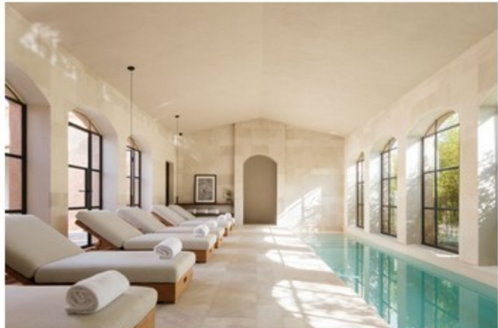
The impressive wellness offer also includes a heated indoor pool. Can Ferrereta