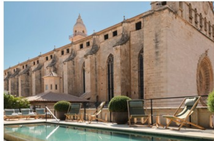
The hotel's rooftop terrace includes a bar and a swimming pool. Sant Francesc

With the aim of preserving the cultural heritage of old buildings, the Soldevila Ferrer family has opened some exciting hotels in the country in recent years, including the "Villa Soro" in San Sebastián or the "Can Ferrereta" in Santanyà. The third strike is located in Palma, a few metres from the Cathedral of Sant Francesc. In the middle of the 19th century Built in the century as a magnificent manor house, the 5-star hotel " Sant Francesc " was carefully restored under the care of the Soldevila Ferrer family: the former watchtower now serves as a room, the old stables now house the restaurant "Quadrat", and the former well is sweated on the treadmill. The interior is decorated in simple creams and grey tones, custom-made furniture and pieces by Antonio Citterio, Jaime Hayon and Piero Lissoni complement the neoclassical setting. With works by Guillem Nadal, Riera i Aragà and Dominica Sánchez, the old walls serve as a showcase for contemporary art, as in the family's sister hotels. By the way: On the roof terrace you can also be visited as an external guest in the evening – the view over the city is particularly impressive at sunset.